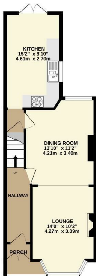
GROUND FLOOR 515 sq.ft. (47.8 sq.m.) approx.