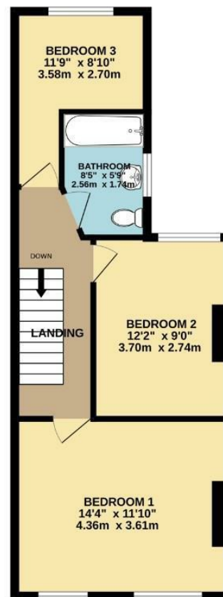
1ST FLOOR 475 sq.ft. (44.1 sq.m.) approx.